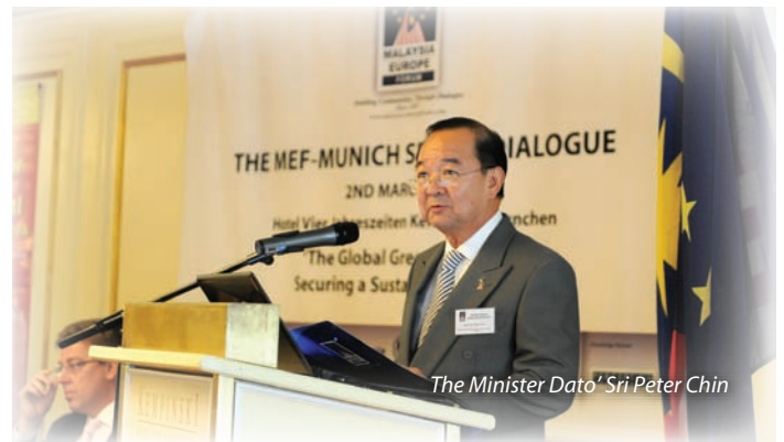
The Minister Dato' Sri Peter Chin

For a copy of our report, contact natasha@malaysia-europeforum.com .