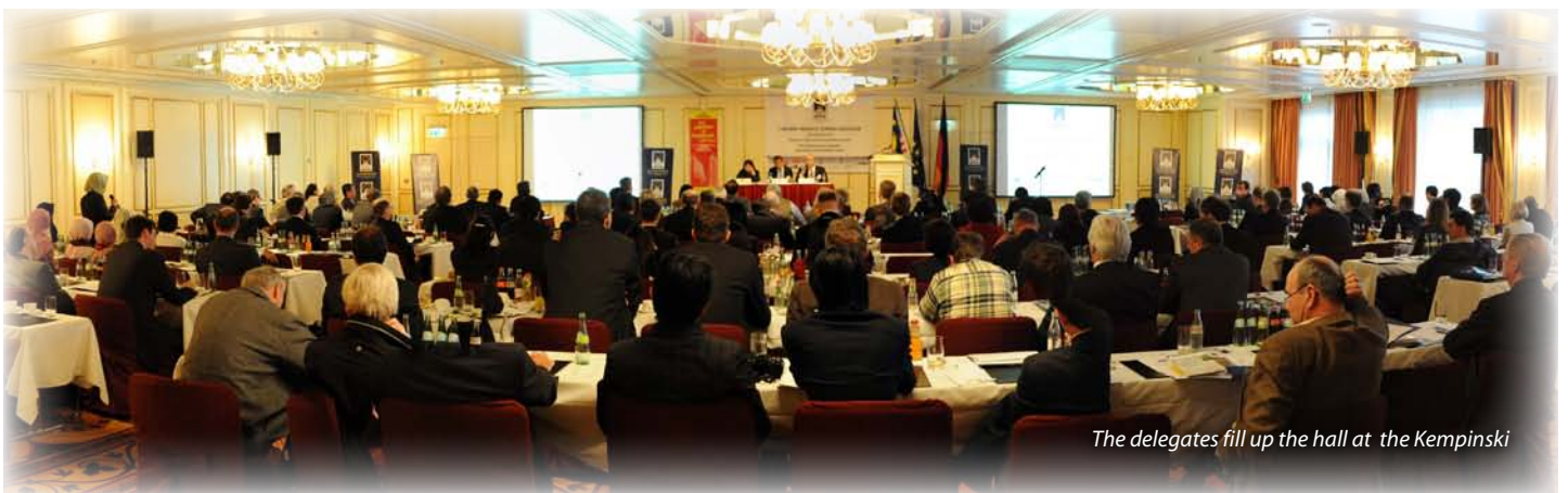
The delegates fill up the hall at the Kempinski