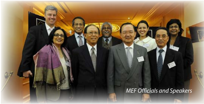
MEF Officials and Speakers